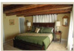
Crescent Lake Room