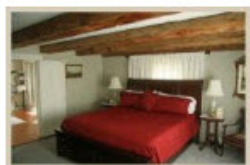
Lake Winnepesaukee Suite

A roll away bed is available at $45. per night.